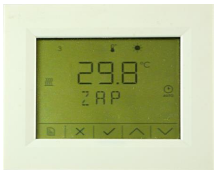
Display options and layout of icons