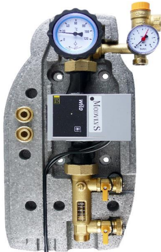
WILO Yonos Para pump connection